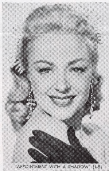
"APPOINTMENT WITH A SHADOW" (1-8)